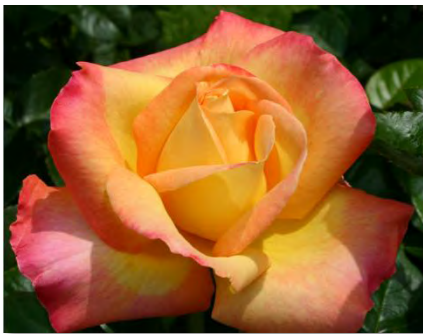
Love & Peace